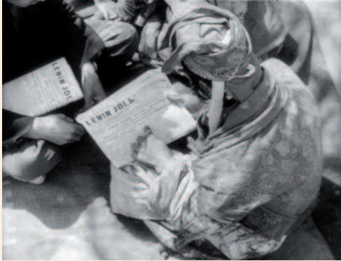
Dziga Vertov. Tri Pesni o Lenine [Three Songs about Lenin]. Film, 1926.