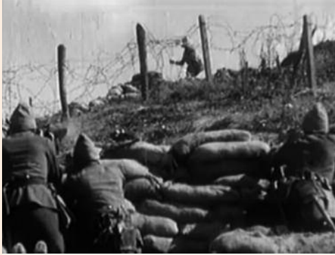
Esfir Shub. Ispaniya [Spain]. Film, 1939