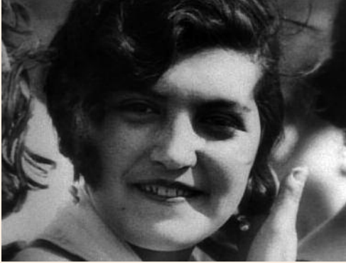
Portrait of Esfir Shub