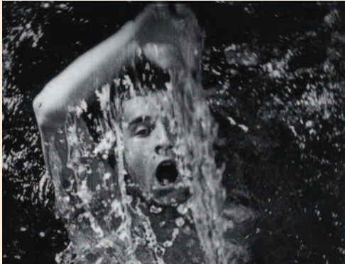
Jean Vigo. Taris, rois de l'eau [Taris, King of the Waters]. Film, 1931.