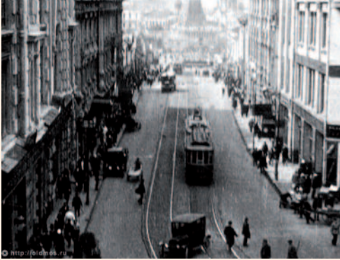
Mikhail Kaufman. Moskva [Moscow]. Film, 1927

Museo Reina Sofía. Sabatini Building. Auditorium