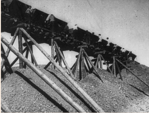
Viktor Turin. Turksib – Stal'noj put' [Turksib – The Steel Road]. Film, 1929.

Museo Reina Sofía. Sabatini Building. Auditorium