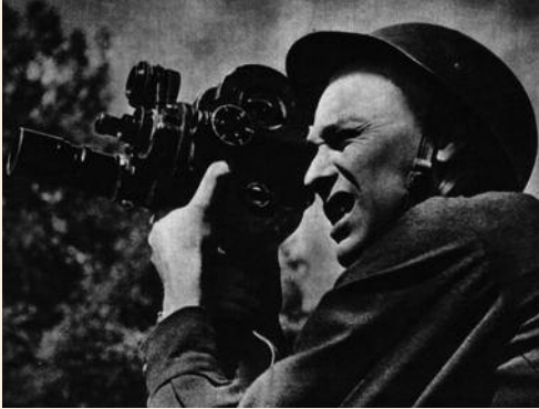
Portrait of Roman Karmen