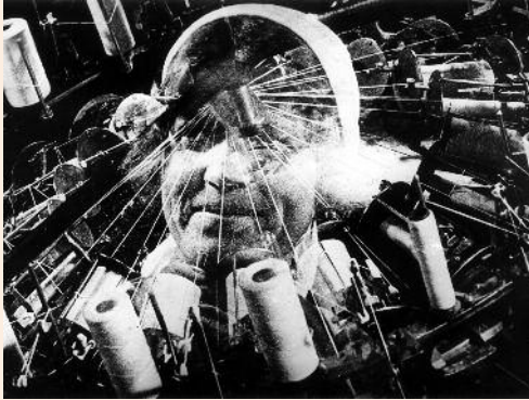
Dziga Vertov. Chelovek s kinoapparatom [Man with a Movie Camera]. Film, 1929.