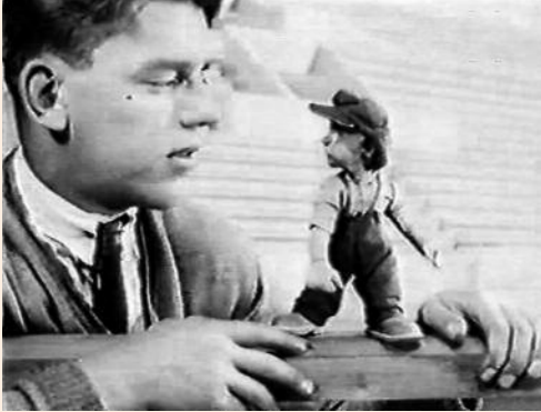
Aleksandr Ptuško. Slučaj na stadione [An Event at the Stadium]. Film, 1928

Museo Reina Sofía. Sabatini Building. Auditorium