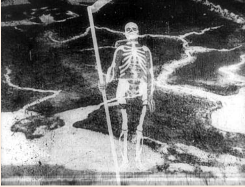
Dziga Vertov. Šagaj, Sovet! [Stride, Soviet!]. Film, 1926. Courtesy of the Deutsche Kinemathek