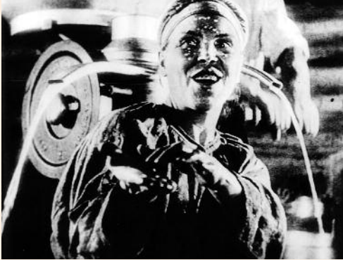
Sergei Eisenstein. Staroie i Novoie o General'naia liniia [The Old and the New or The General Line]. Film, 1929.

Museo Reina Sofía. Sabatini Building. Auditorium