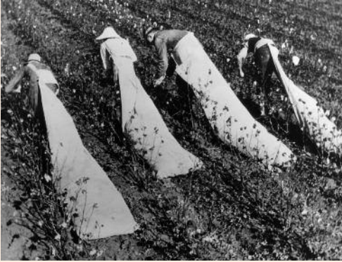
Pare Lorentz. The River . Film, 1937

Museo Reina Sofía. Sabatini Building. Auditorium