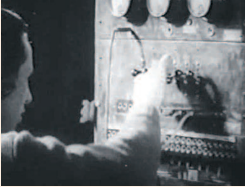
Esfir Shub. Komsomol –shef elektrifikatsii [Komsomol: The Boss of the Electrification]. Film, 1932

Museo Reina Sofía. Sabatini Building. Auditorium