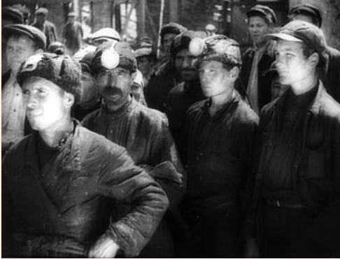
Joris Ivens. Pesni o geroiakh [Song of Heroes]. Film, 1931. EYE Filmmuseum Collection

Museo Reina Sofía. Sabatini Building. Auditorium