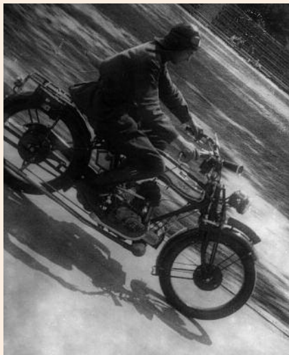
Mikhail Kaufman. Vesnoi [Spring]. Film, 1929.