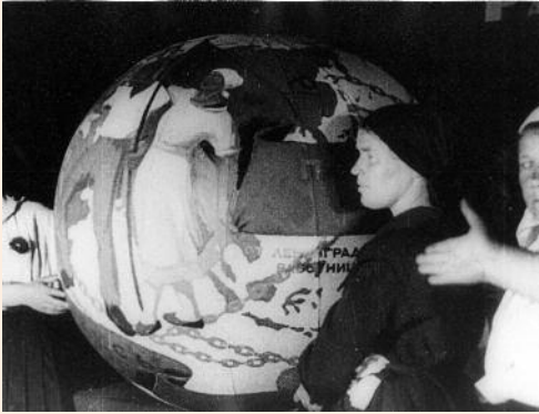
Dziga Vertov. Šestaja ast' mira [One Sixth of the World]. Film, 1926.