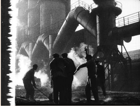
Dziga Vertov. Entuziazm [Enthusiasm/Donbass Symphony]. Film, 1930.