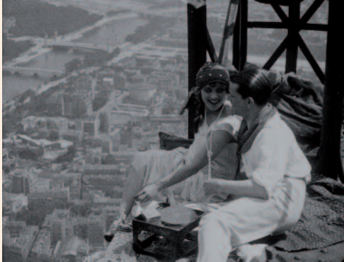
René Clair. Paris qui dort [Paris Asleep or The Crazy Ray]. Film, 1928.

Museo Reina Sofía. Sabatini Building. Auditorium