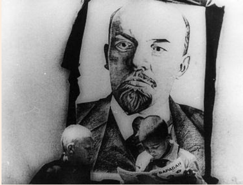
Dziga Vertov. Kinoglaz [Kino-Eye]. Film, 1924.