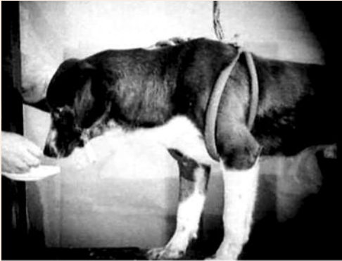
Vsevolod Pudovkin. Mekhanika golovnogo mozga [Mechanics of the brain]. Film, 1926