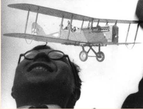
Dziga Vertov. Odinnadtsatyi [The Eleventh Year]. Film, 1928.