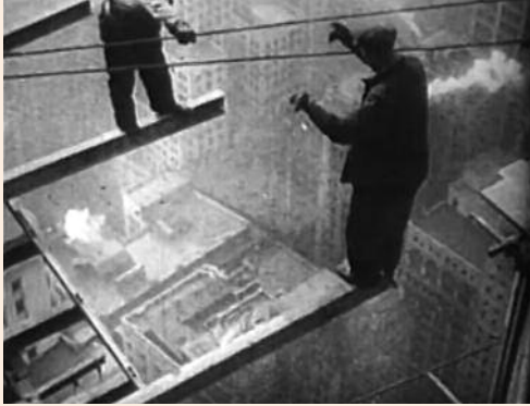
Esfir Shub. Segodnia [Today]. Film, 1930

Museo Reina Sofía. Sabatini Building. Auditorium