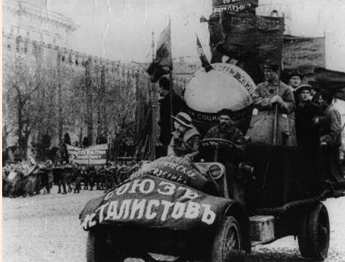
Dziga Vertov. Kinonedelja nr. 1 [Kino-Week no. 1]. Film, 1918.

Museo Reina Sofía. Sabatini Building. Auditorium