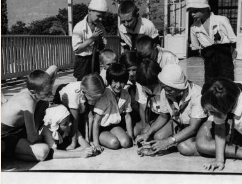
Dziga Vertov. Kolibel'naja [Lullaby]. Film, 1937.