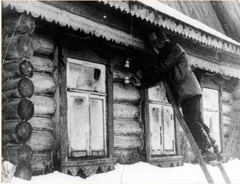
Dziga Vertov, Kino-pravda: 23. Radiopravda [Kino-Truth: 23. Radiopravda]. Film, 1925.

Museo Reina Sofía. Sabatini Building. Auditorium