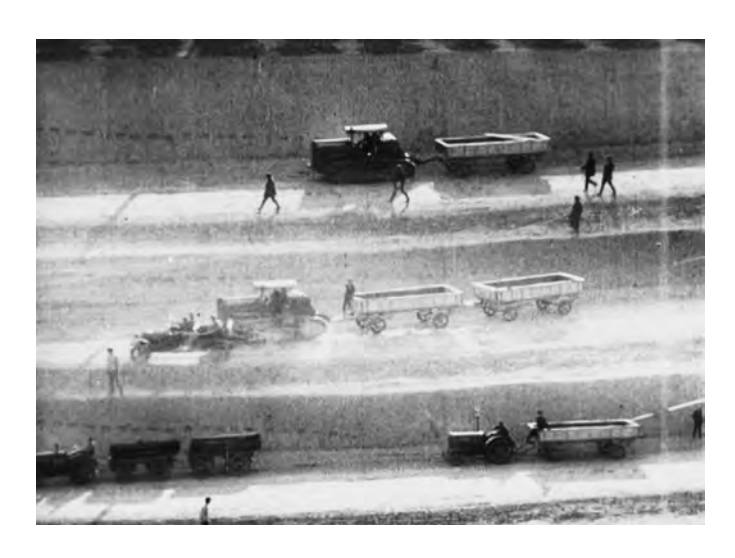
Vertov. The Eleventh Year. 1928.