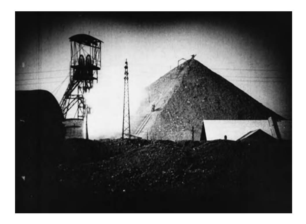
Vertov. The Eleventh Year. 1928.

an occasion to stage the symbolic triumph of the latter over the former. From this perspective, the primitive nomads are exhumed by Vertov only in order to be put again to rest—definitively this time. Such an interpretation situates Vertov within a chorus of avant-garde voices whose enthusiasm for industrialization took the form of an aggressively liquidationist policy toward Russia's premodern past. Whereas after the French Revolution, the newly established bourgeois class began to dress in togas, build in a neoclassical idiom, and generally revive the cultural precedents of antiquity, the society inaugurated by the October Revolution was, by contrast, aggressively futurist in orientation. Seduced by the rhetoric of supersession and the vision of a Russia modernized according to the Western model, many of the revolutionaries took up their historical teleologies and, denouncing Russia's uneven development, proclaimed a radical break with the country's backward past.