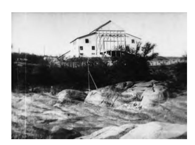
Vertov. The Eleventh Year. 1928.

In addition to the dam-pyramid and other pseudomorphic likenesses that the film uses to connect "phenomena that are temporally remote from one another," there are three specific devices, more sophisticated in their application, through which Vertov complicates the simple unidirectional scheme of history. First is superimposition, a visual strategy found in a number of Vertov's films but deployed with particular philosophical acuity in The Eleventh Year . In this film Vertov layers incommensurate elements upon one another—peasant houses, igneous rock formations, a bust of Lenin—without attributing anteriority to any one of them. At once a reference both to a primordial, antediluvian state and to the flood that will soon inundate the basin after the dam's construction, the recurring image of water, for example, indexes the region's past and its future