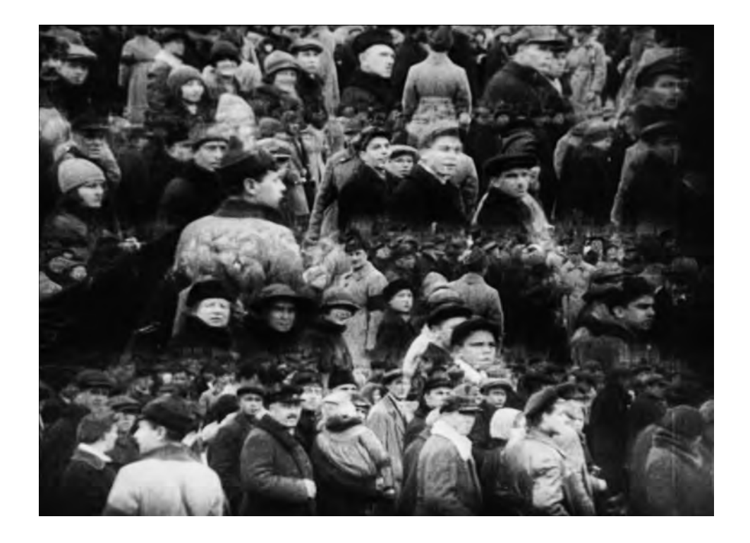
Vertov. The Eleventh Year. 1928.

ing to the spectator that the overwhelming visual chaos on the screen is in fact just a single event that has been refracted through two temporal dislocations. If the event appears to the viewer as multiple, if all he perceives is a random congeries of bodies, this is only because he has failed to discern the underlying continuity and order linking these moments together. Vertov thereby trains the spectator's eye upon the islands of identity, invariance, and continuity that endure within the Heraclitean river of history, a river whose currents had been gaining speed in Russia since 1917.