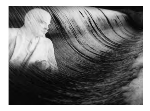
Vertov. The Eleventh Year. 1928.

allochronisms suggest that historical progress is not always as consistently linear and universal, and that the course of technological development not as uniformly remainderless, as the liquidationists might want to assume.